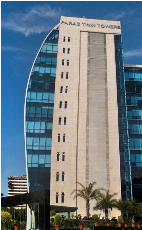
Paras Twin Towers (Sec 54, Gurgaon)