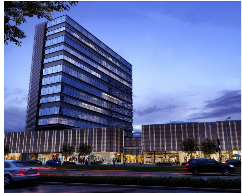
Paras Trinity (Sec 63, Gurgaon)