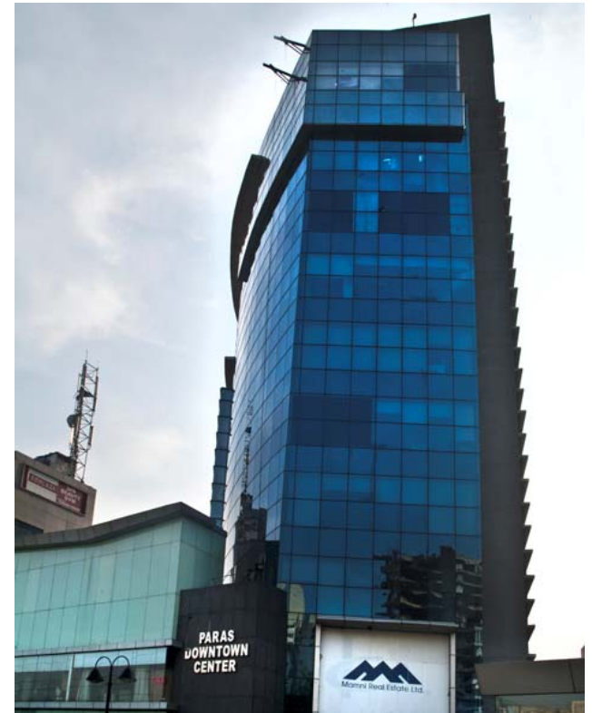
Paras Downtown Center (Sec 53, Gurgaon)