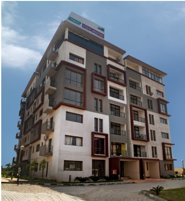
Paras Panorama (Mohali, Punjab)