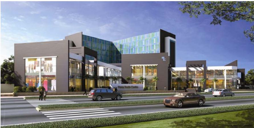
Paras Trade Centre (Sec 2, Gwalpahari, Gurgaon)