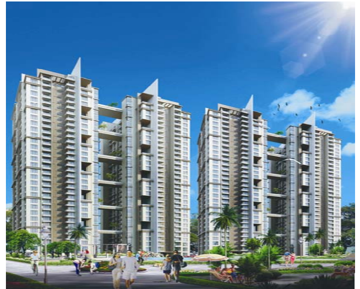
Paras Tierea (Sec 137, Expressway Noida)