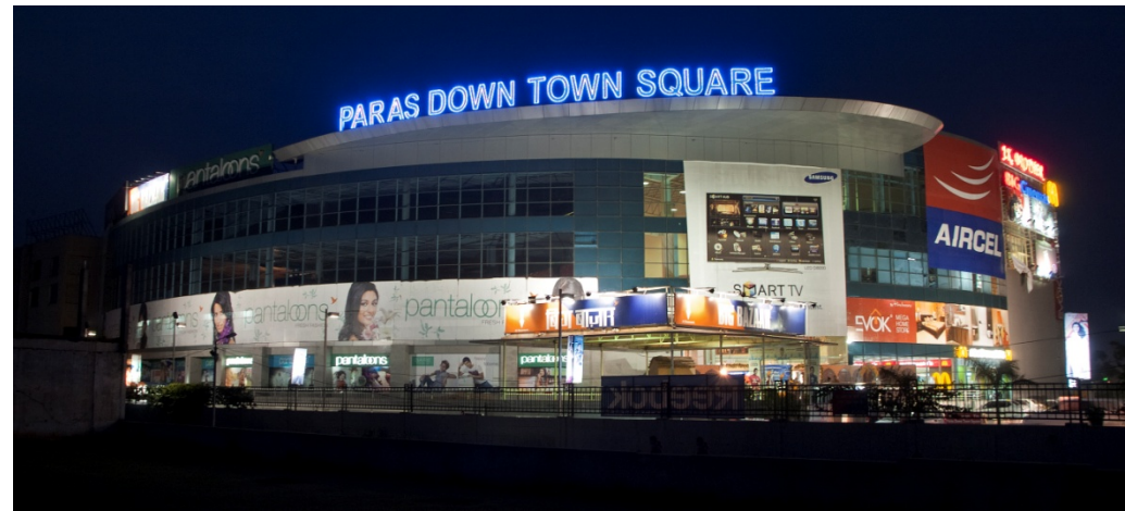
Paras Downtown Square Mall (Zirakhpur, Punjab)