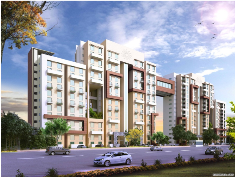
Paras Seasons (Sec 168, Expressway Noida)